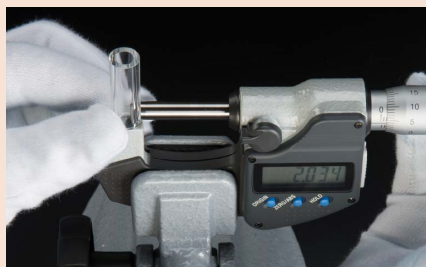
Type A (pin)