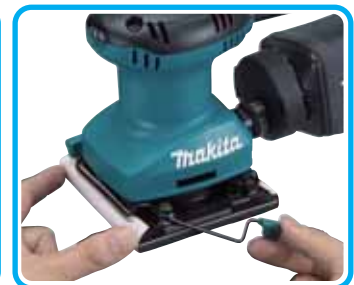
Easy-to-Operate Paper Clamp Easy installation/removal of paper with rolled clamber's edges