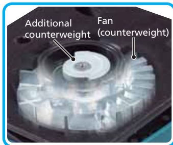
Function for Low Vibration

Instead of Dust Bag, Makita Vacuum Cleaner can be connected to the tool using Adapter.