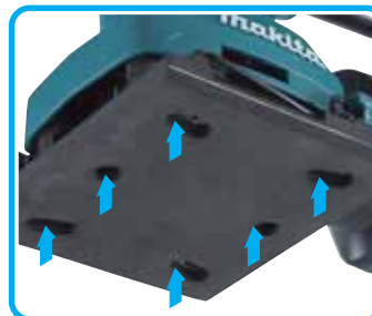
High Dust Extraction Dust is extracted through 6-hole under Pad and collected into Dust Bag.