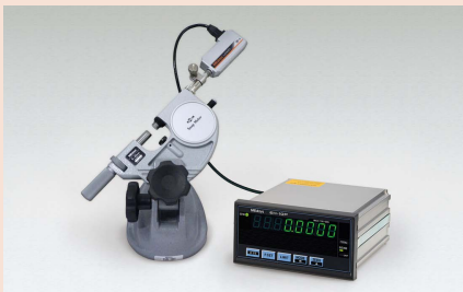
Linear Gage and counter