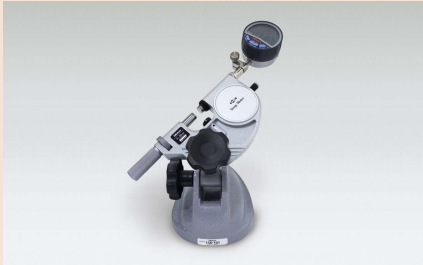
ABS Digimatic Indicator