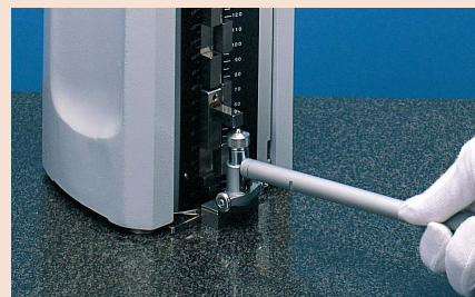
Bore gage zero-setting