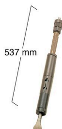
Model S-250 Non-CE