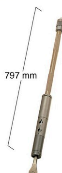
Model S-500 Non-CE